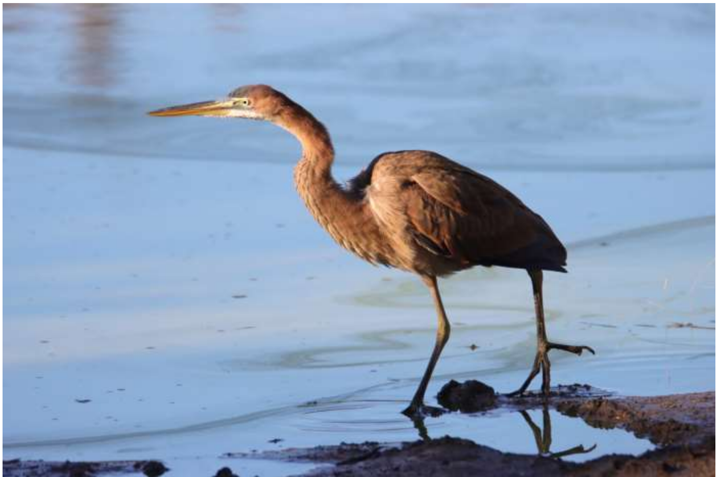
Purple heron.

Would you like to have an underground bird hide on the Estate? A few owners have suggested that for the real bird lovers and photographers, this could be a fantastic added feature. Management would welcome any comments from owners. Please let us have your thoughts by e mailing: info@raptorsviewhoa.co.za Maybe this could become a special Owners' Project? Is there anyone out there that has experience in setting up an underground hide and willing to take it on? An investigation would need to be done on the costs involved as well as whether or not an Environmental Impact Assessment is necessary.